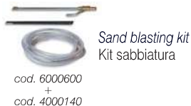
Sand blasting kit Kit sabbatura