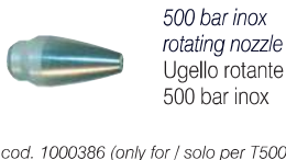
500 bar inox rotating nozzle Ugello rotante 500 bar inox

cod. 1000386 (only for / solo per T500.19)