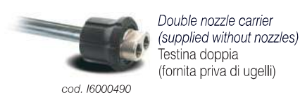
Double nozzle carrier (supplied without nozzles) Testina doppia (fornita priva di ugelli)