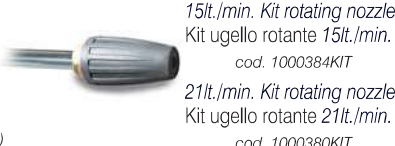
15lt./min. Kit rotating nozzle Kit ugello rotante 15lt./min.

cod. 1000386 (only for / solo per T500.19)