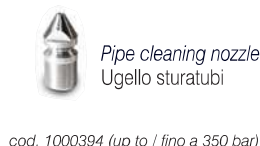
Pipe cleaning nozzle Ugello sturatubi