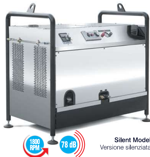
Silent Model Versione silenziosa