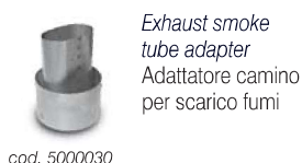
Exhaust smoke tube adapter Adattatore camino per scarico fumi